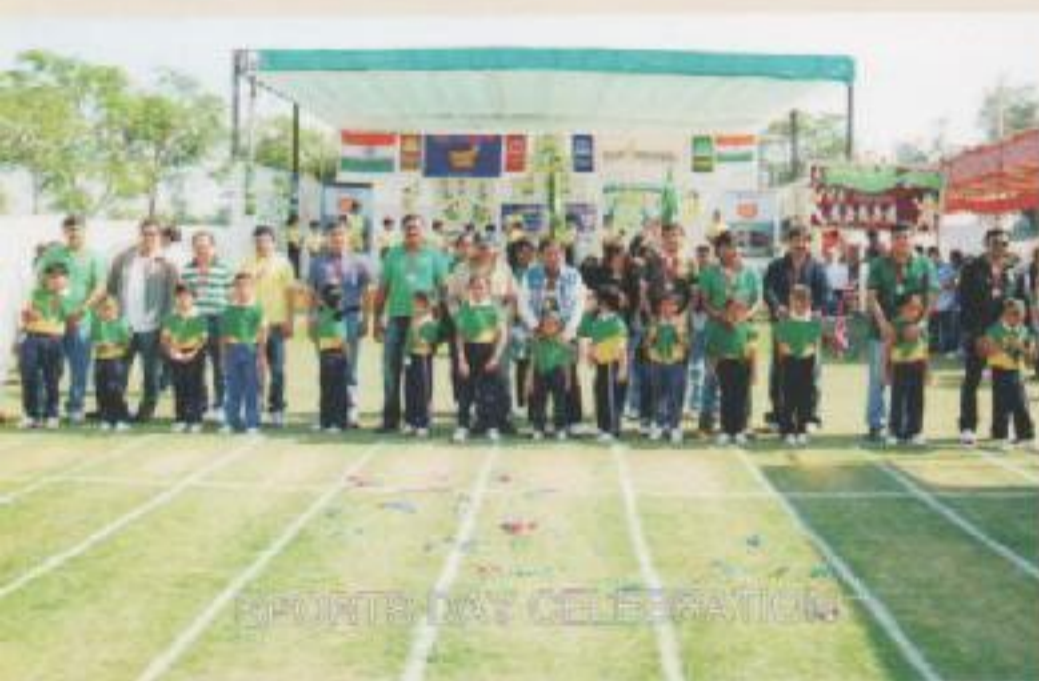
SPORTS DAY CELEBRATION